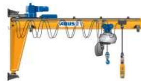
Fig.: VW with optional configurations (electric slewing gear and mobile control unit)