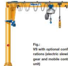
Fig.: VS with optional configurations (electric slewing gear and mobile control unit)

Capacity: to 6.3 t Jib length: to 10 m →)